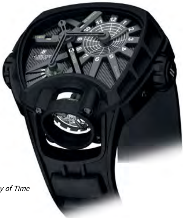
MP-02 Key of Time