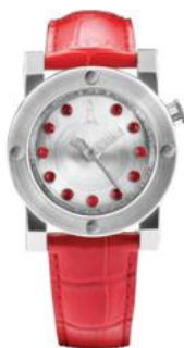
THE CHINESE TIMEKEEPER Booth no: 3G-F10