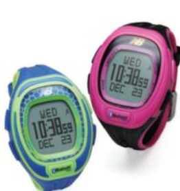
NEW BALANCE Booth no: 3F-D26