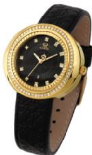
CLETA Booth no: 3F-A13