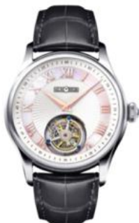
MEMORIGIN Booth no: 3G-E01