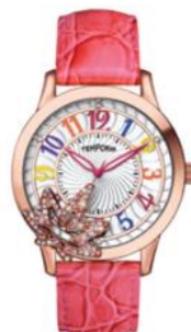
TEMPORIS Booth no: 3F-F30