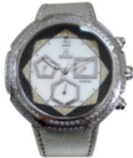
AMVERSS Booth no: 3F-D34