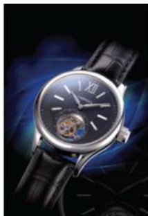
CORNELL Booth no: 3G-F02