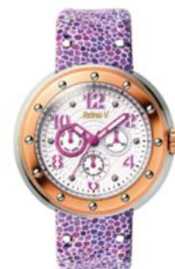
REINA V Booth no: 3G-B37