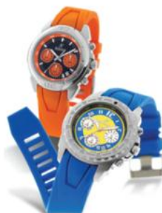
KIN-MIX Booth no: 3F-C29