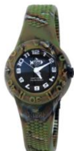
SCUBA100 Booth no: 3F-A18