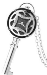
QUE Booth no: 3F-C29