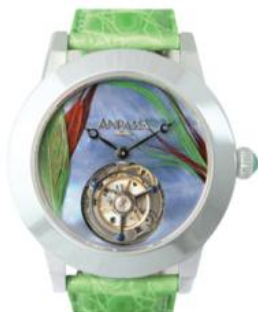
ANPASSA Booth no: 3G-G06