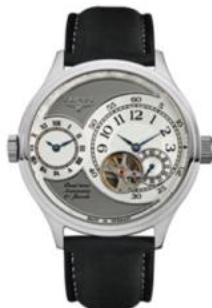
ELYSEE Booth no: 3G-F15