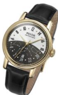
EPOS Booth no: 3G-F08