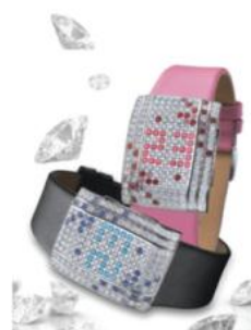
L.E.D. LIFE EVOLUTION DESIGN Booth no: 3F-D08