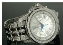
MONTROA & CO Booth no: 3F-D03