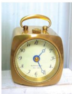
KEYFORD Booth no: 3F-A02