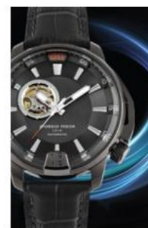
GIORGIO FEDON 1919 Booth no: 3F-C24