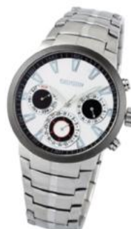
GEIGER Booth no: 3F-A12