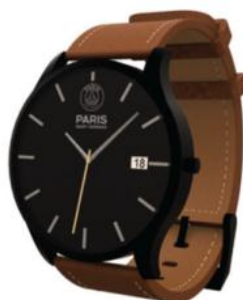
PARIS SAINT GERMAIN Booth no: 3F-A30