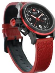
UNITED ARMY Booth no: 3F-C29