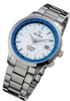
OLMA Booth no: 3G-E38