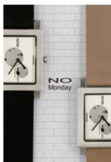
NO MONDAY Booth no: 3F-A17