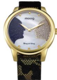
MOOG PARIS Booth no: 3G-C36