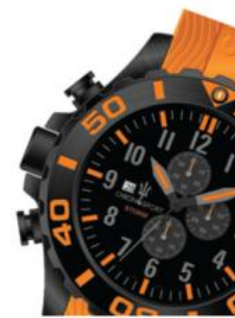
CHRONOSPORT Booth no: 3F-A15