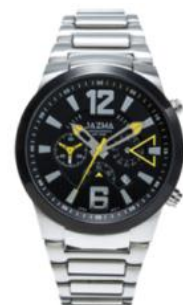
JAZMA Booth no: 3F-G10