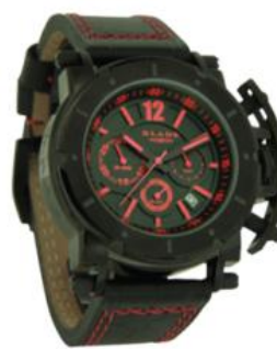
BLADE Booth no: 3F-B01