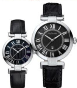
GUY LAROCHE Booth no: 3F-D08