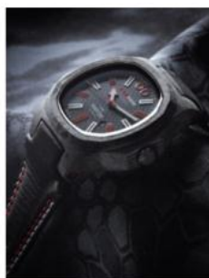
ITANANO Booth no: 3F-B24