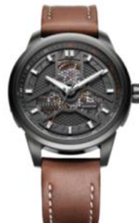
FIYTA Booth no: 3G-G10