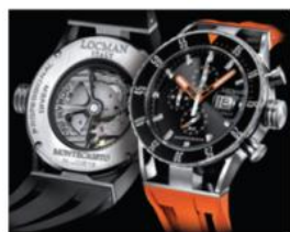
LOCMAN Booth no: 3F-F36