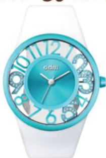
ODM Booth no: 3F-E30