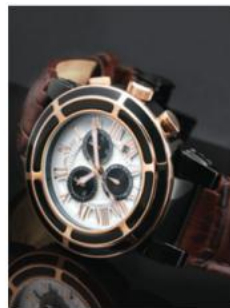
HELVECO Booth no: 3G-F29