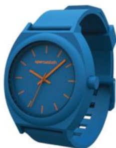
OPENWATCH Booth no: 3F-A30