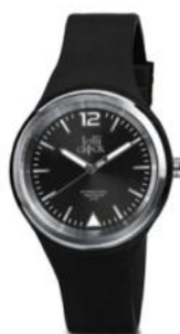
LOLLICLOCK Booth no: 3F-G01