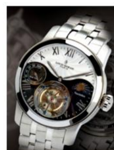
LOUIS MORAIS Booth no: 3F-B05