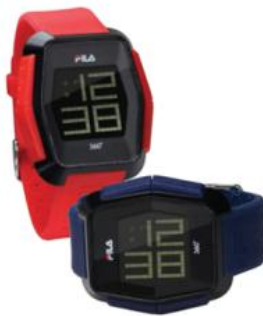
FILA Booth no: 3F-D26