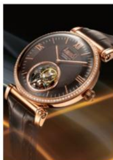
ARBUTUS Booth no: 3F-D08