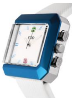
EZIO Booth no: 3F-T01