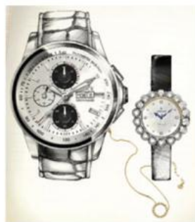
CROCE Booth no: 3F-D01