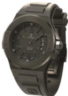
DWISS Booth no: 3G-F33