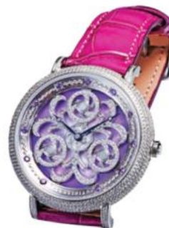
VALENTINIAN Booth no: 3G-G08