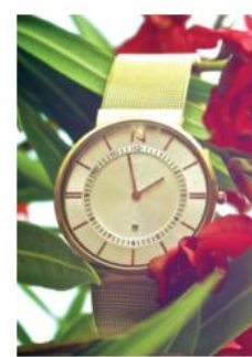
NORDIC Booth no: 3F-E38