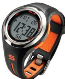
SOLUS Booth no: 3F-D26