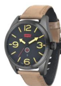
LEVI'S Booth no: 3F-E30