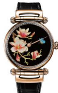
KONCISE Booth no: 3G-G04