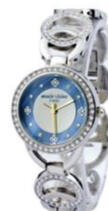
MARIE CLAIRE Booth no: 3F-A18