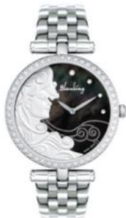
BLAULING Booth no: 3G-E13