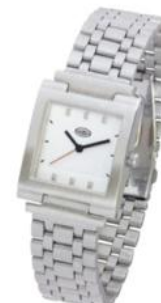
TIME ENGINE Booth no: 3F-E33