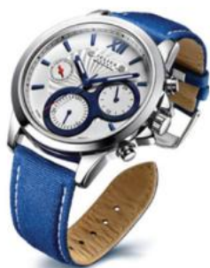
JULIUS Booth no: 3F-D09