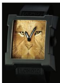
LONGIO Booth no: 3G-F07