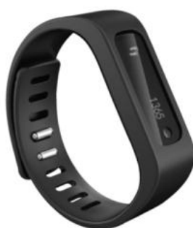
FASHIONCOMM Booth no: 3F-A31