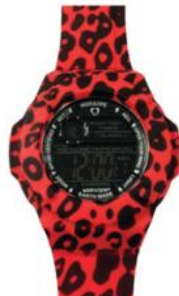
WIZE & OPE Booth no: 3F-G06