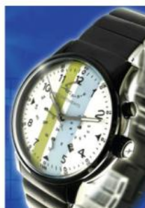
TRANS CONTINENTS Booth no: 3F-G06