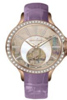
VAN GOGH Booth no: 3G-D15