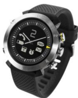
COGITO Booth no: 3F-T02