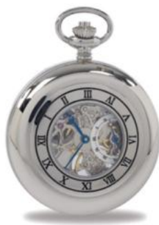
RAPPORT Booth no: 3G-G24