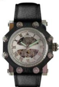
HOLING Booth no: 3F-A09